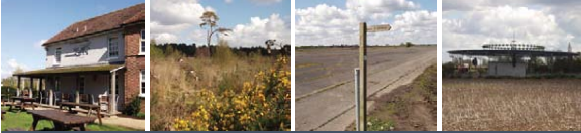
1 2 3 4